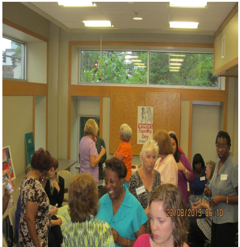
LR Annual Meet and Greet which corresponded with Lilly Ledbetter's speaking engagement at Little Rock Library – Main

AAUW Little Rock Branch Members took advantage of a golden opportunity to see, hear and visit with the legendary Lilly Ledbetter on August 22nd at the Central Arkansas Library in Little Rock.