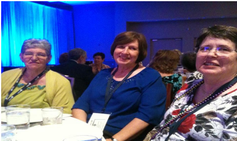
AAUW Fayetteville and AAUW Hot Springs at the Opening Dinner of National Convention