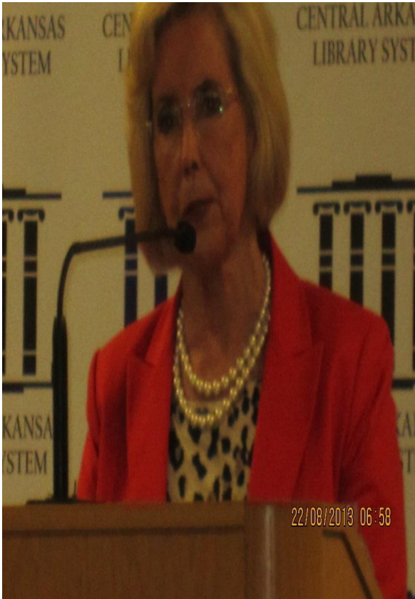
Lilly Ledbetter speaking in Little Rock at the same time as the LR Branch Annual Meet and Greet!