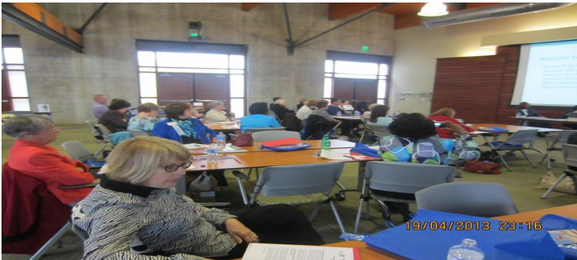
State Convention attendees!

Lilly Ledbetter's book is in the planning stages for a movie!!!!